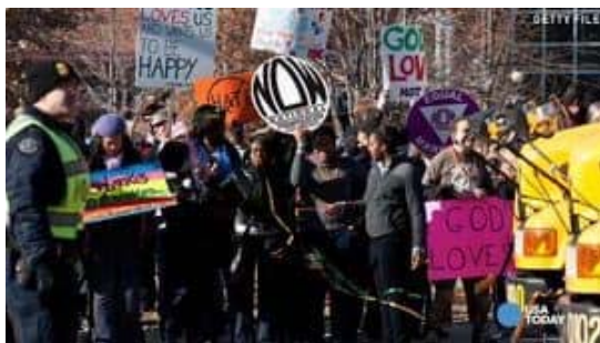
Opinion: Arizona isn't crazy enough to target gay kids