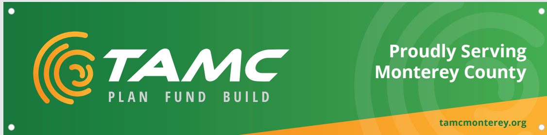
CONCEPT 1: Mockups